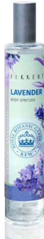
4627 BODY SPRITZER