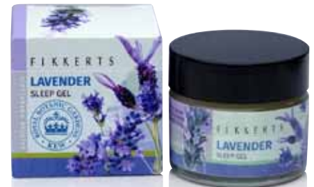
4630 SLEEP GEL