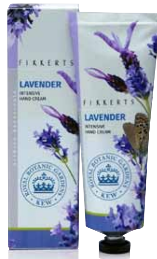
4618 INTENSIVE HAND CREAM