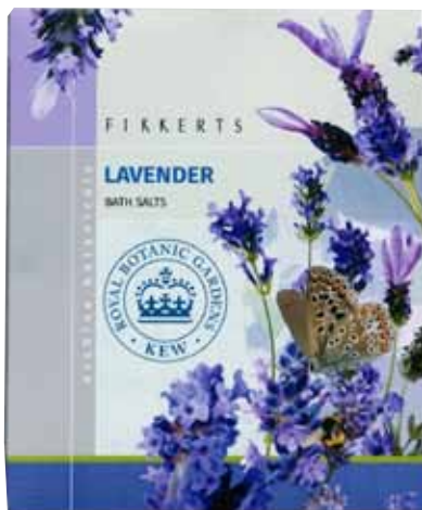
4624 BATH SALTS