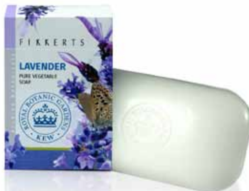
4621 PURE VEGETABLE SOAP