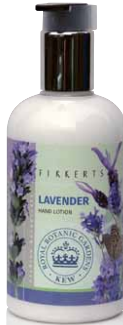
4612 HAND LOTION