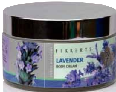
4615 BODY CREAM