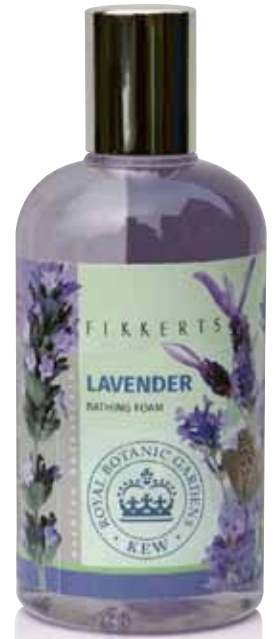
4603 BATHING FOAM