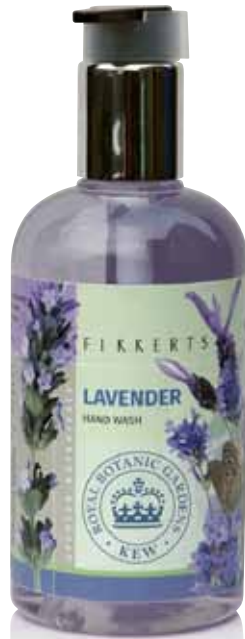
4609 HAND WASH