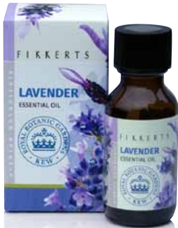
4633 ESSENTIAL OIL