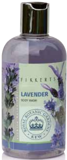
4606 BODY WASH